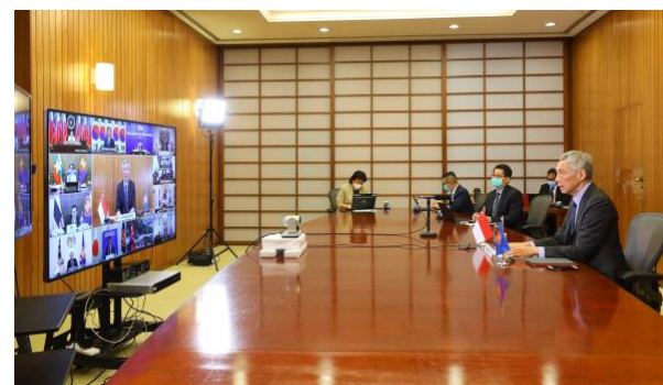
Special ASEAN Plus Three Summit on COVID-19