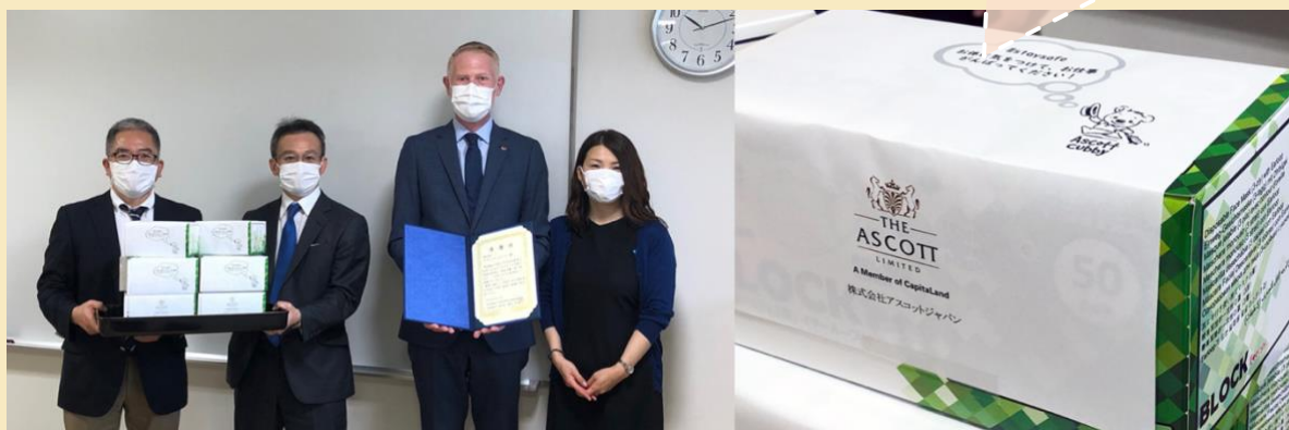
Representatives of Citadines Shinjuku Serviced Apartments presenting the donated masks to Futaba Infant Home

CapitaLand donated 15,000 masks to children homes and orphanages in Japan. The masks were presented to local welfare associations in Tokyo and Chiba in May 2020.