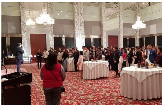
New Year Reception