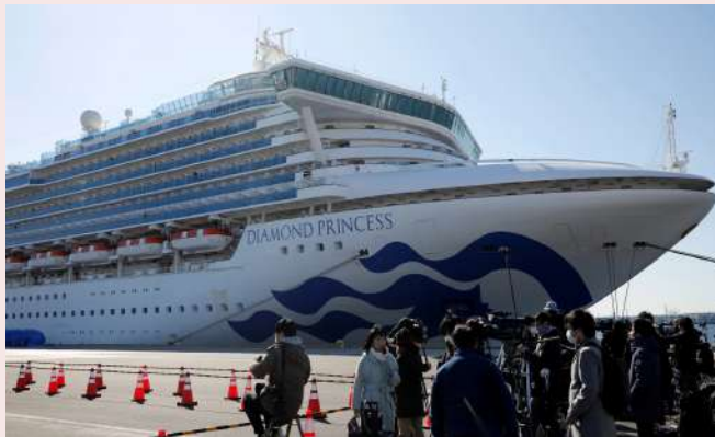
Diamond Princess cruise ship in Yokohama Port

COVID-19 has brought significant disruptions and challenges to the Embassy's activities, from telecommuting to reorienting work priorities, as we navigate the uncharted waters of the pandemic. But it has also given us opportunities to reach out to and help Singaporeans in meaningful ways. In this section, we share with you some highlights of what the Embassy has been doing during the pandemic.