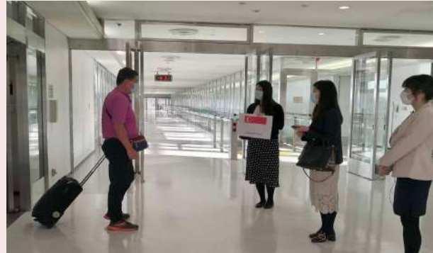
Receiving Singaporeans from Fiji at Narita Airport

We are fortunate that commercial flights have continued to run between Singapore and Japan during the pandemic, although on a reduced schedule. However, some Singaporeans have been stranded in other countries due to COVID-19 lockdowns and travel restrictions. Some of them were able to return to Singapore via Tokyo. For example, the Embassy facilitated their transits, such as the repatriation of seven Singaporeans from Fiji in April 2020.