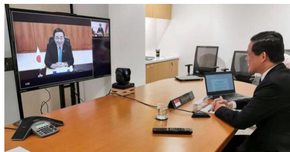
Minister (T&I) Chan Chun Sing with Minister of Economy, Trade and Industry Kajiyama Hiroshi, 1 May

In April, we also celebrated the conferment by the Japanese government of the Order of the Rising Sun, Gold and Silver Star on former Ambassador to Japan (2012 – 2017) Chin Siat Yoon in recognition of his contributions in promoting friendship and mutual understanding between Singapore and Japan!