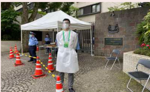
Polling Day at the Embassy