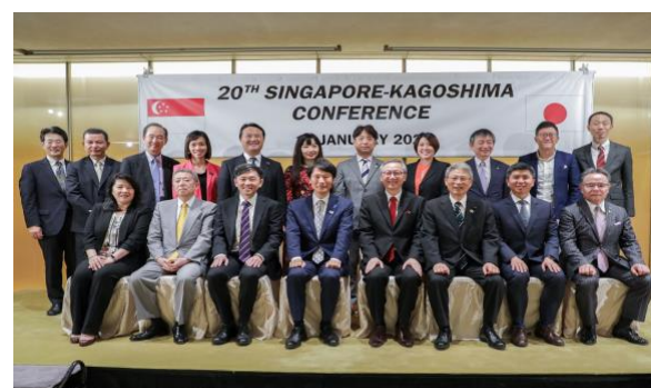
20th Singapore-Kagoshima Conference