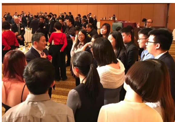
Ambassador with NUS students in Hiroshima