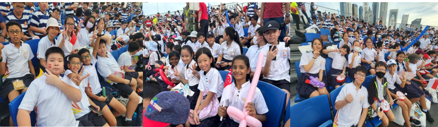
Our P5 Springdalite posing for photos with their friends as memories of this special event

Our Springdalites braved the heat and joined enthusiastically with the emcees of the Parade in singing the National Day songs. They showed encouragement to the performers by cheering and applauding for them throughout the show.