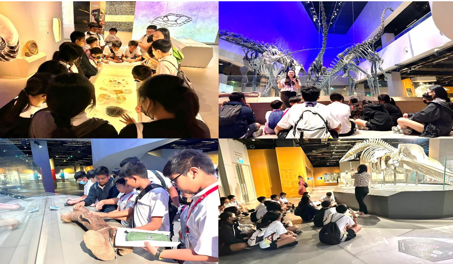
Springdalites engaged in interactive activities that illustrated the unique adaptations of organisms found in nature

Our P6 Springdalites took part in a workshop on Singapore Biodiversity and Adaptation as well as a guided gallery tour at the Lee Kong Chian Natural History Museum.