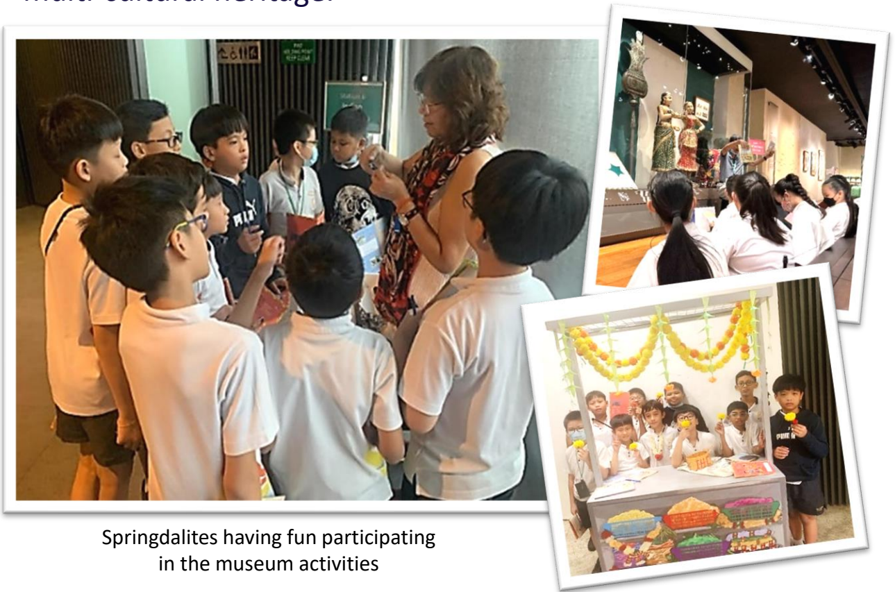
Springdalites having fun participating in the museum activities

In Term 3, our P5 Springdalites went for their Museum-based Learning Journey to the Indian Heritage Centre. Through this learning experience, our Springdalites recognised the contributions made by the Indian community in Singapore towards nation-building and understood how the different influences from the diverse cultures have shaped Singapore's multi-cultural heritage.