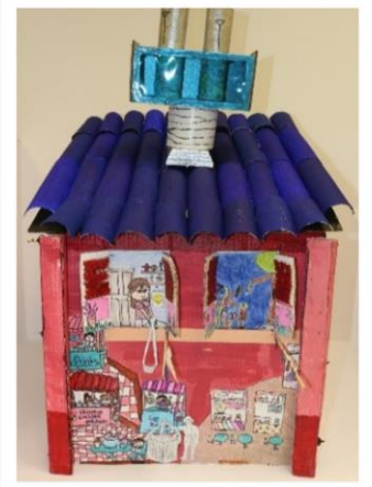
Category B – Hawker House