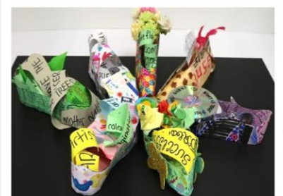
Category C- Walk In My Shoes