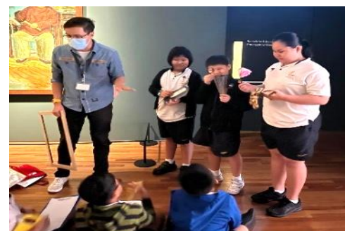
Listening attentively during the session