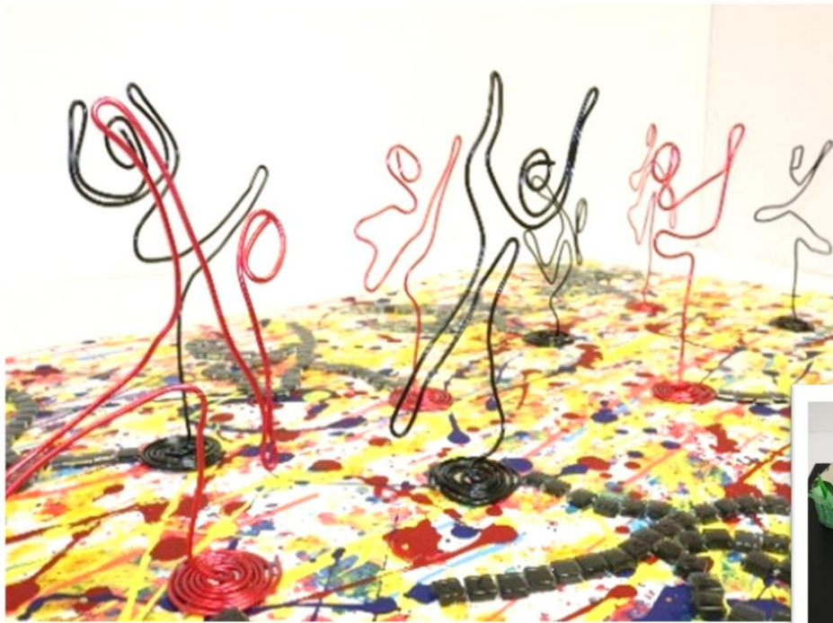
Category A – Rhythmic Splatters

Special congratulations to our Category A students on receiving a Certificate of Recognition for their entry.