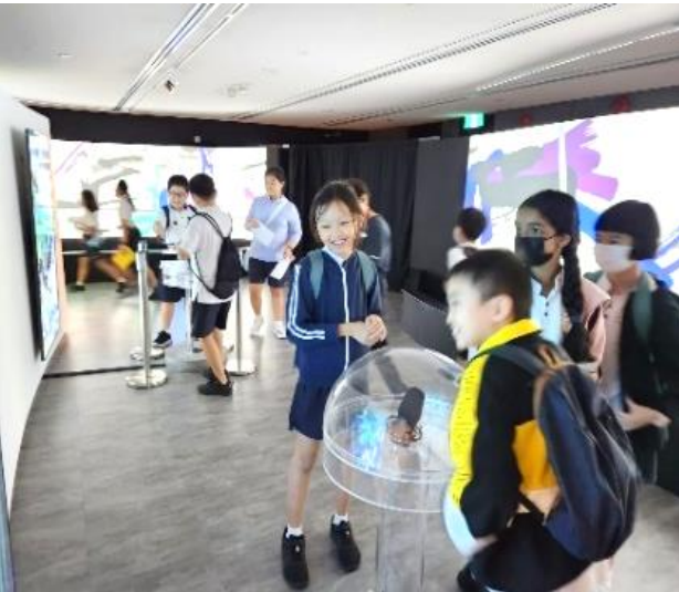
Interactive activities at the INK-credible Exhibit

The Art Department scheduled two visits to National Gallery Singapore on 30 June and 14 July. The visits serve as the core learning experiences for our P4 Springdalites as part of the Art curriculum.