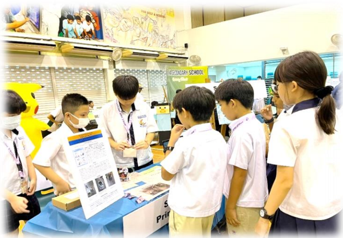
Our talented Springdalites in Action!

Selected P4 and P6 Inno-T(h)inkers Club members represented Springdale Primary School at the Pei Hwa Hackathon 2023.