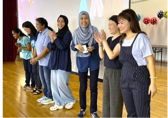
Thank you PVs for your support!

The Springdale Parent Volunteer Club chipped in with their games item during the celebration. Our Springdalites and teachers had a great fun together. Thank you parent volunteers for the wonderful session.