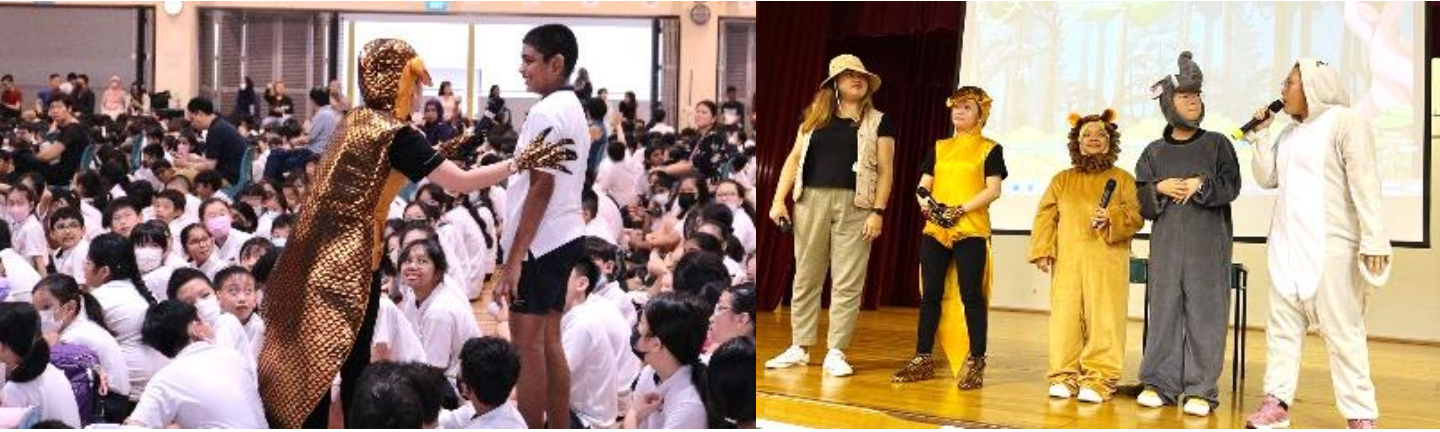
Springdalites participating actively during Quiz time

Springdalites commemorated Racial Harmony Day on 21 July. During assembly, Springdalites watched a performance entitled 'Party at the Night Safari' . The interactive play taught children about diversity in the community and the importance of respecting the different races and cultures.