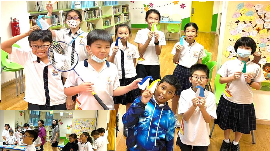
Proud Springdalites with their origami