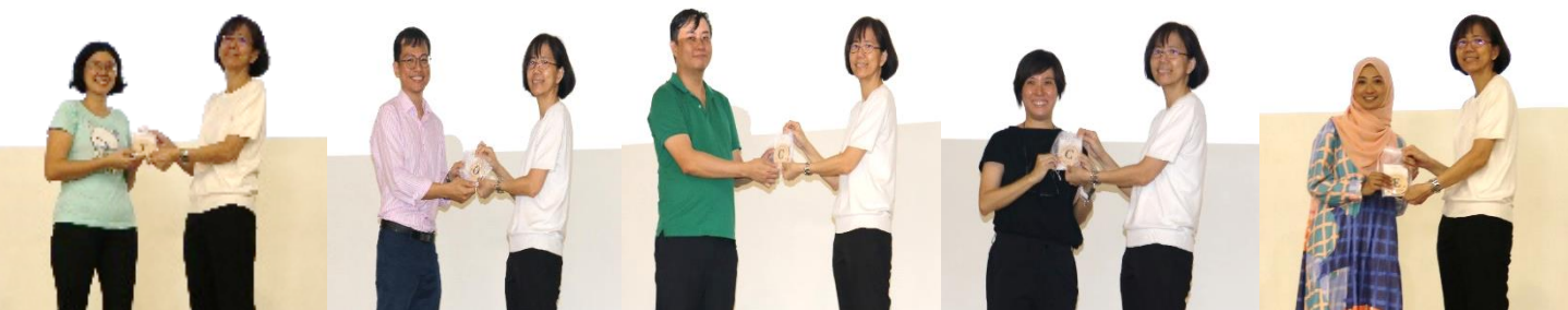
Congratulations to all the teachers!

The "GREAT" Awards were also presented to our teachers. These teachers have been nominated by their colleagues for demonstrating the "GREAT" expectations of staff.