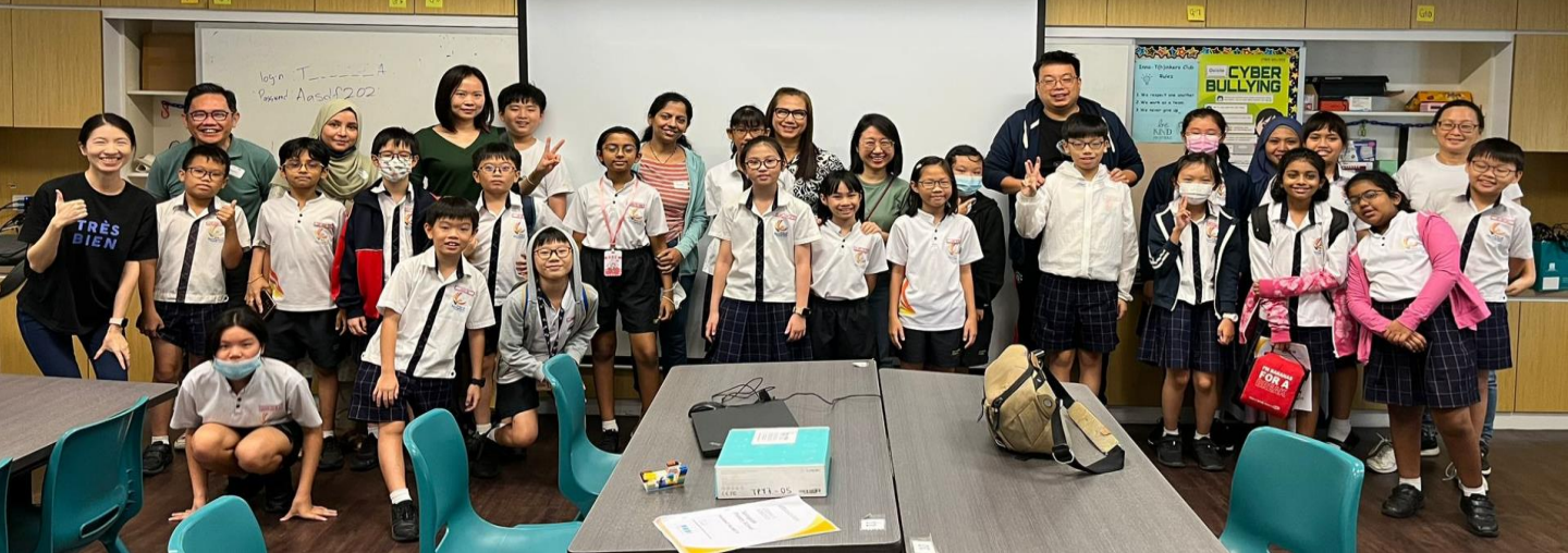
Working in teams to create their prototype using LEGO and MODI Expert Kit

Parents were invited to join in the workshop, and it was a fun and meaningful experience for all!