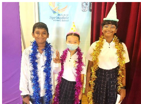
Our P5 Student Leader emcees

The school celebrated Teachers' Day on 31 August. To show their appreciation for teachers, our student leaders and class monitors penned thank you notes for the teachers and non-teaching staff in the school.