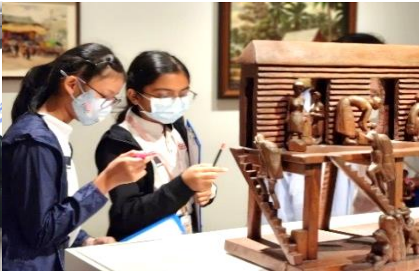
Studying the sculpture

The guided tours were led by the facilitators with knowledge and passion for the exhibits. There were interactive activities from the Children Biennale & hands-on art workshops to virtual reality experiences, making the entire learning a joyous adventure for everyone.