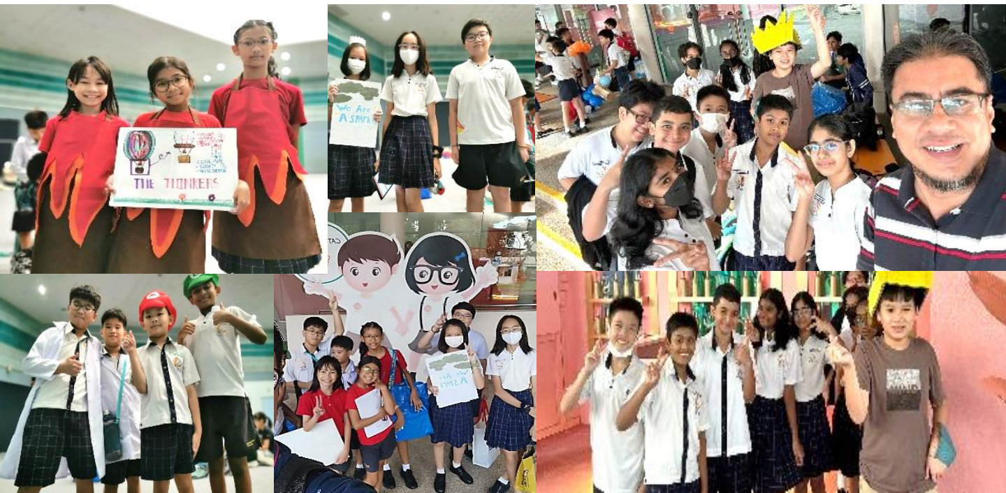
Our Science Buskers during the audition round at Science Centre

Our Springdalites worked hard to prepare for the competition with a few rounds of rehearsal and performed commendably during the audition round at Science Centre on 4 July.