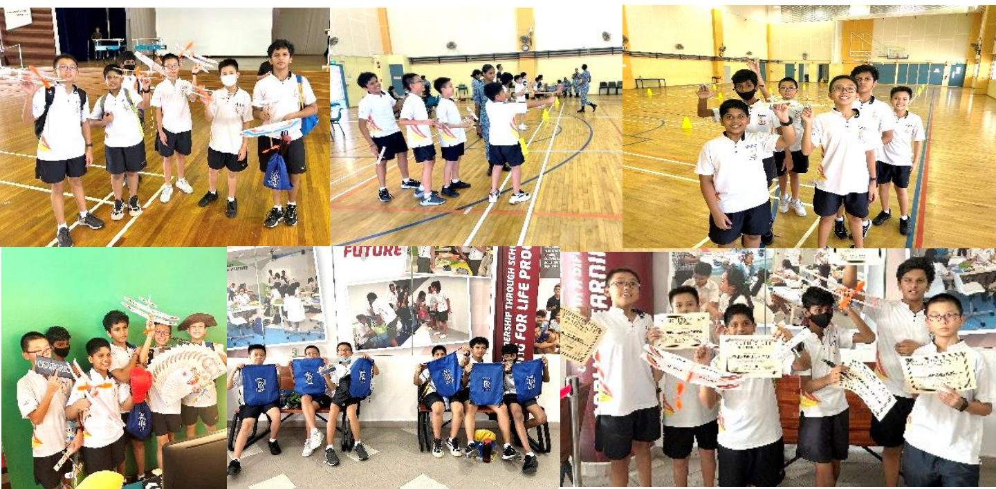
Participants of the Fly High Aviation Carnival at Changkat Changi Secondary School

During the carnival, our Springdalites had the opportunity to learn about various aspects of aviation through engaging workshops, including the various aspects of aircraft design, flight simulation and the future application of drones. They also participated in various hands-on activities, such as building and flying their own model aircraft and flying drones through obstacles.