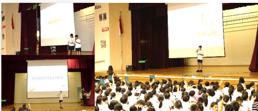
Sharing by participants of SAFMC and Fly High Aviation Carnival during assembly

Our Springdalites were wowed by the 'paper plane throw' demonstration by our participants! You can click the highlights of Science X-perience Week at this link .