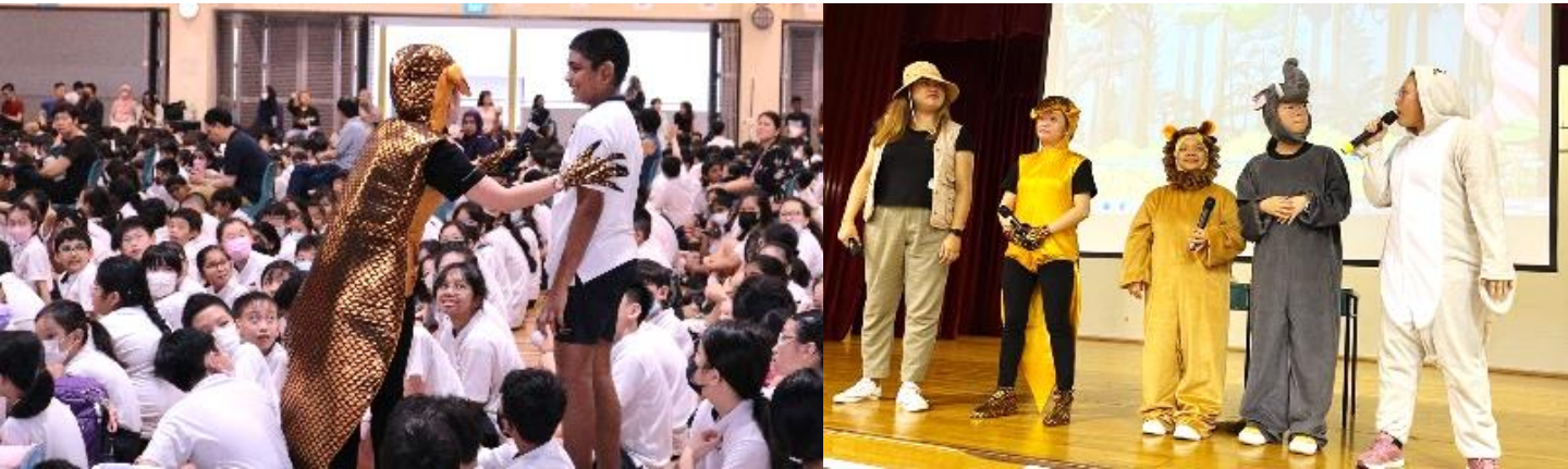
Springdalites participating actively during Quiz time

Springdalites commemorated Racial Harmony Day on 21 July. During assembly, Springdalites watched a performance entitled 'Party at the Night Safari' . The interactive play taught children about diversity in the community and the importance of respecting the different races and cultures.