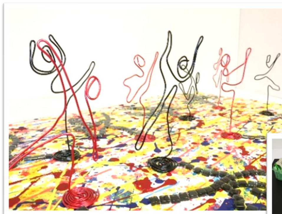
Category A – Rhythmic Splatters

Special congratulations to our Category A students on receiving a Certificate of Recognition for their entry.