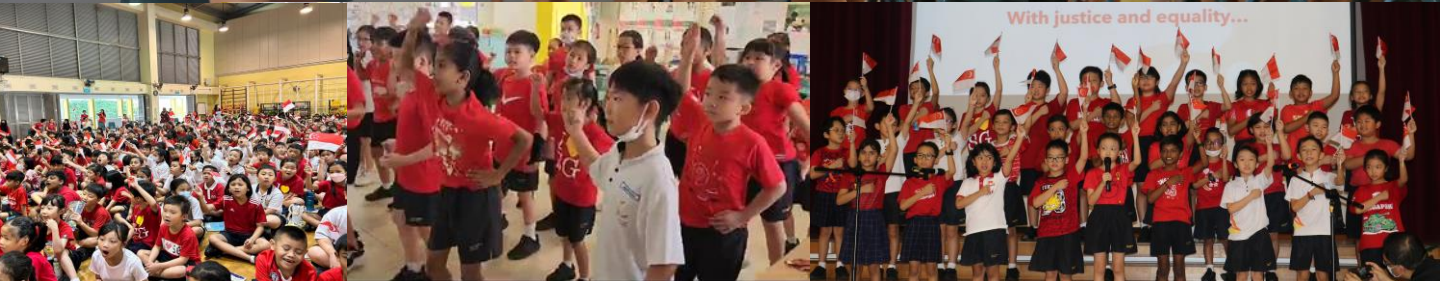
Springdalites celebrating National Day

There were also performances from our school's aesthetic CCAs, community singing, a game segment and a video segment of Springdalites' wishes for Singapore!