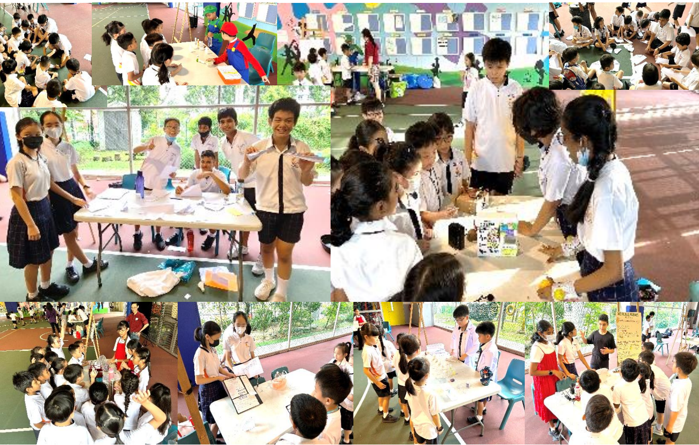
Science Buskers live demonstration during recess

There was also a Paper Plane booth by our participants from SAFMC who shared their experiences in folding paper planes.