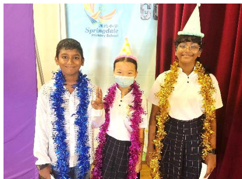
Our P5 Student Leader emcees

The school celebrated Teachers' Day on 31 August. To show their appreciation for teachers, our student leaders and class monitors penned thank you notes for the teachers and non-teaching staff in the school.