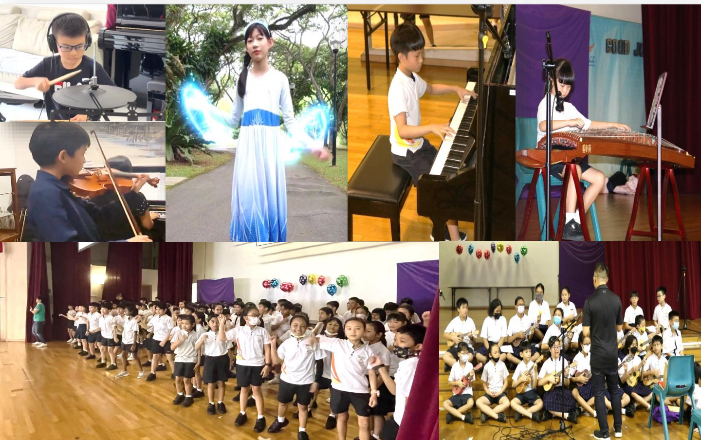
Springdalites showcasing their talents and musical skills

Our Springdalites showcased their talents through a variety of performances during the Teachers' Day concert, such as playing the piano, drum, Gu Zheng, singing and dancing.