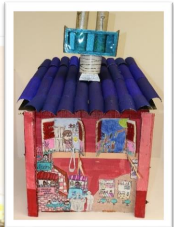
Category B – Hawker House