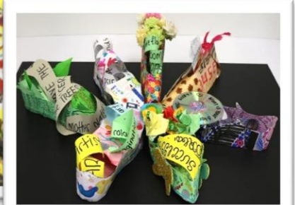
Category C- Walk In My Shoes