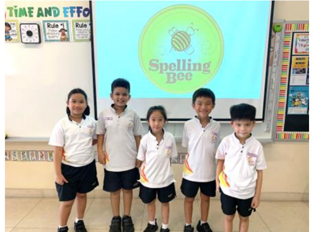
Our P1 Spelling Bee Competition Winners

Students put their spelling skills to the test in a friendly Spelling Bee Competition which aimed to enhance vocabulary and language proficiency and instill a sense of confidence in students' language abilities.