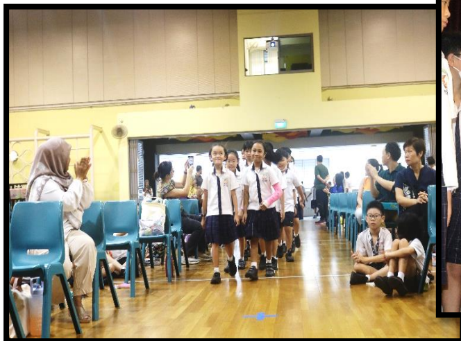
Student Leaders marching down the hall

On 30 June, the Student Leaders marched down the hall and onto the stage to stand proudly to pledge their commitment as student leaders of Springdale Primary School during the 2023 Student Leaders Investiture.