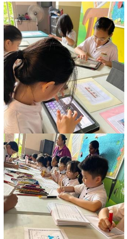
Racial Harmony recess activities

We were heartened to have the support of parents who volunteered their time interacting with our Springdalites and joining them as they completed the various activities.