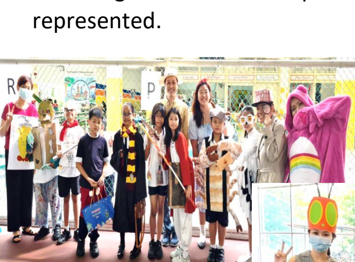
Springdalites and teachers dressed themselves up in their favourite book characters

Imagination then took center stage on Book Character Day. Springdalites and teachers dressed up as their favorite characters from various books, bringing literature to life. Students were encouraged to delve deeper into the stories and themes they represented.