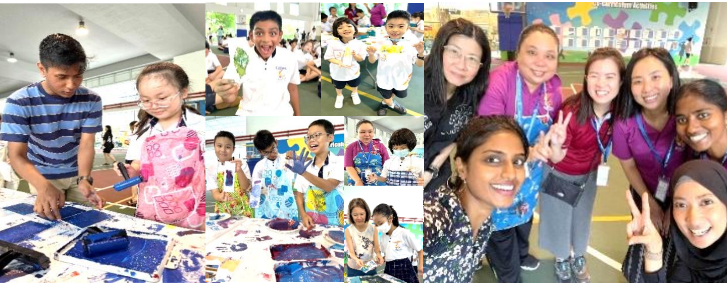
Springdalites exploring various Art Printmaking activities with the help of Art teachers and Parent Volunteers

On 28 July, we had our Aesthetics Moments @ Recess which aimed to promote the creative expression of Springdalites. Springdalites could showcase their musical talent and also try the hands-on activities at the Art Booth.