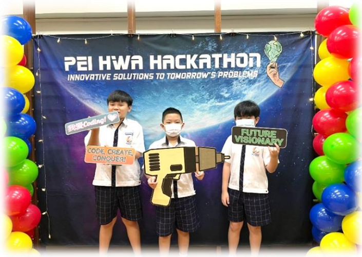
Our talented Springdalites in Action!

The theme for the Pei Hwa Hackathon is Innovative Solutions to Tomorrow's Problems. The team's project, titled Med-Bot , aims to remind the elderly to take their medicine on time.