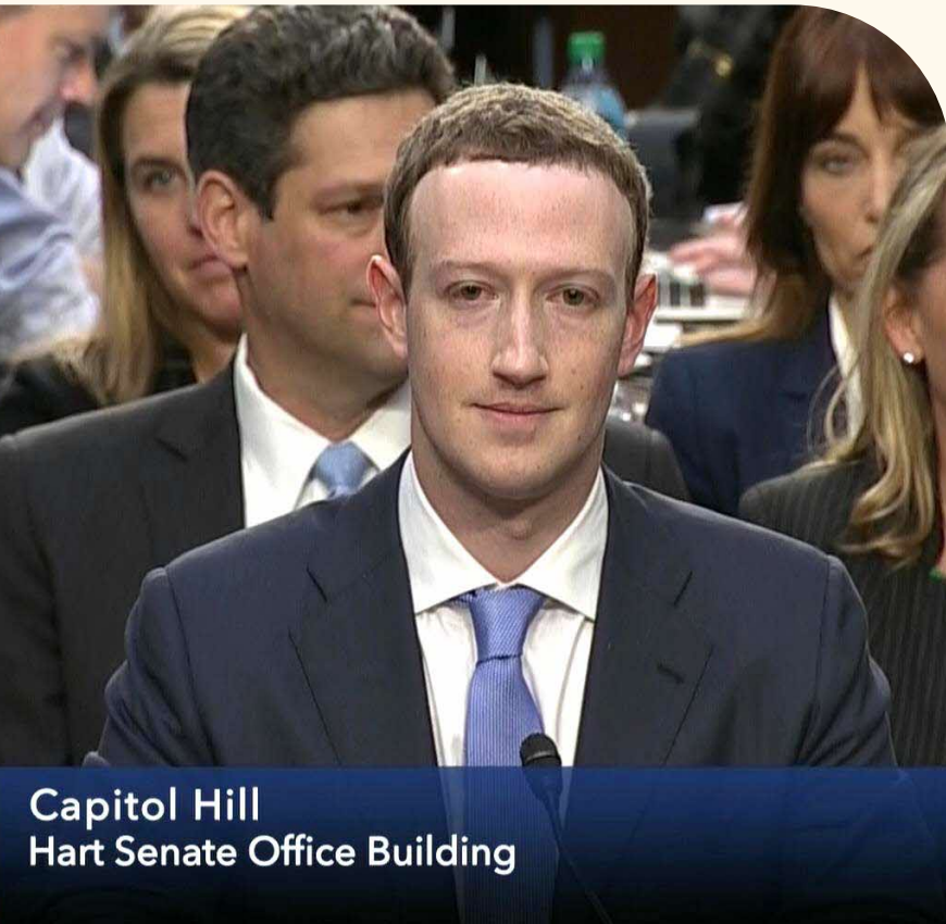
Capitol Hill Hart Senate Office Building

OPENING STATEMENTS FROM SENATORS THUNE, FEINSTEIN & M