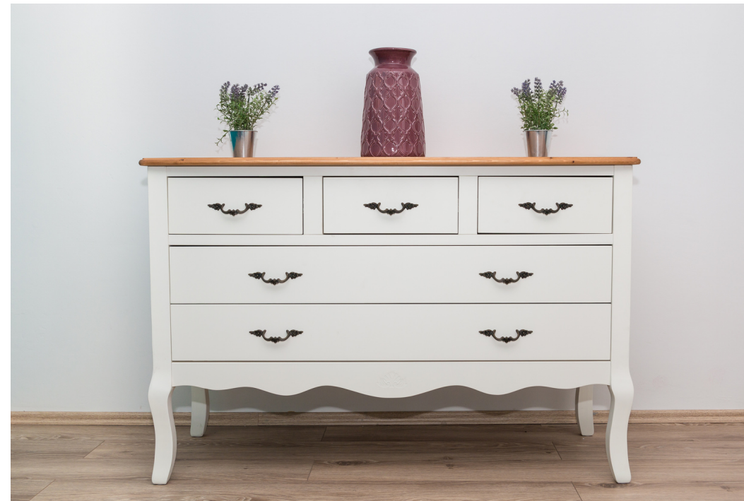
Chest of drawers