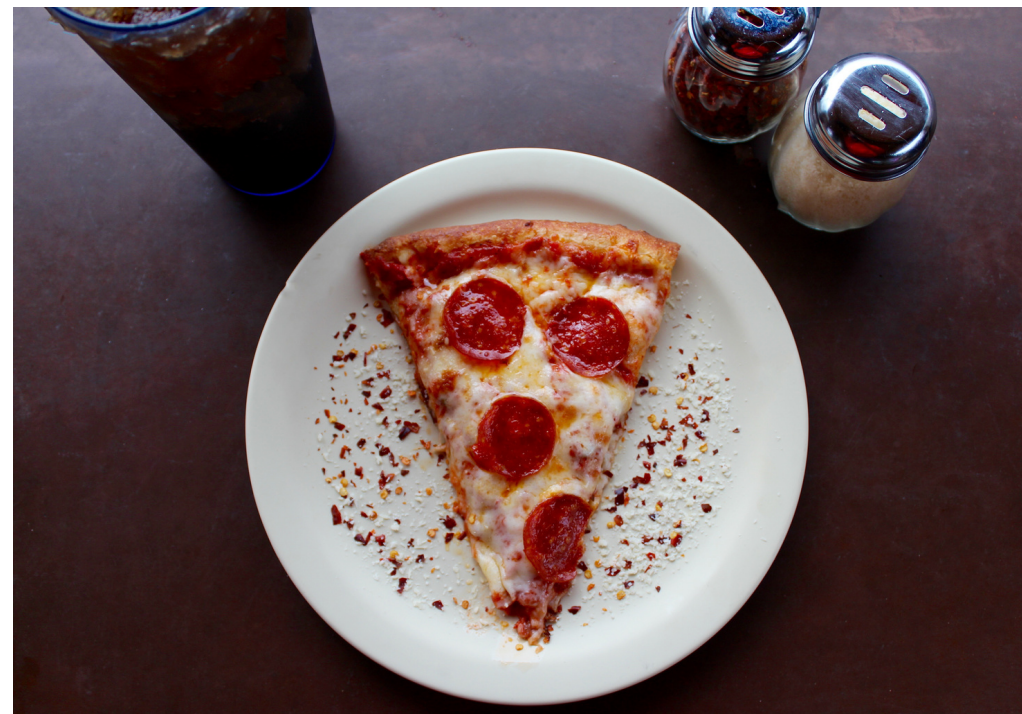
A slice of pizza