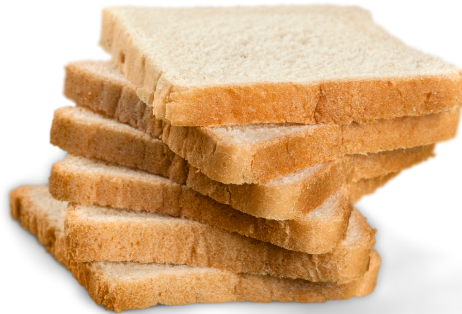
Slices of bread