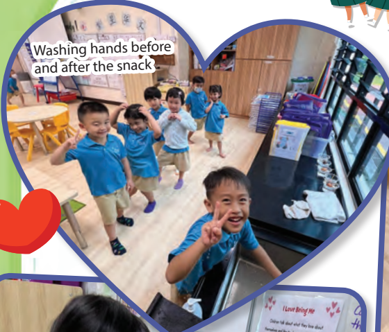
Washing hands before and after the snack