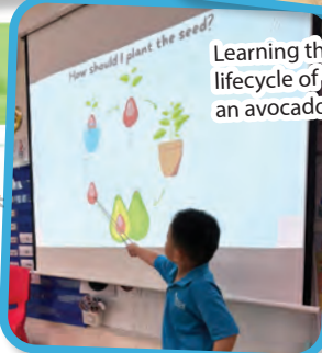
Learning the lifecycle of an avocado