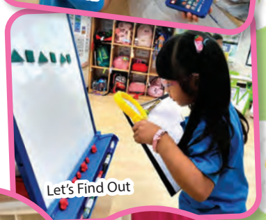
Let's Find Out