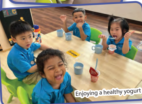
Enjoying a healthy yogurt