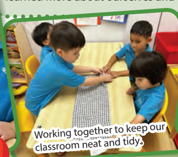
Working together to keep our classroom neat and tidy.

In Term 1, we learned about Who Am I? and had many different experiences to comprehend this topic. First, our teachers aroused our interest by showing us pictures, books and videos about people. When our curiosity about the topic was stimulated, our teachers went on to provoke our thoughts by asking us open- and close-ended questions. Interactive learning experiences were subsequently created for us and information we had discovered during the exploration of the topic was collated. It was a good start to the term as we grew more familiar with the environment, the people in the environment and learned more about ourselves and our emotions.