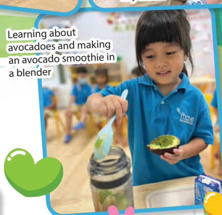
Learning about avocados and making an avocado smoothie in a blender