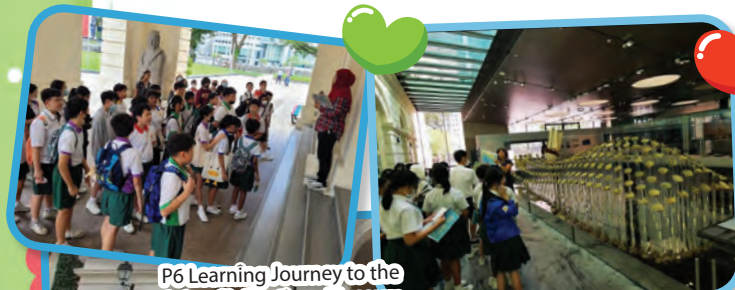
P6 Learning Journey to the Asian Civilizations Museum