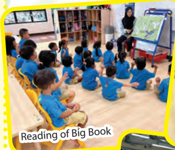
Reading of Big Book