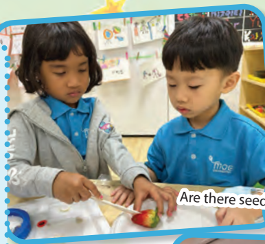
Are there seeds inside a strawberry?

We had our first Weeks of Wonder Project during which we discovered more about our class names. We shared our prior knowledge and decided on what to find out. Our teachers planned many interactive activities such as craft, cookery, gardening and games for us to discover and uncover our answers. We concluded by sharing what we had learned and now we know why we are called Awesome Avocados, Sweet Strawberries, Patient Pineapples, Incredible Iced Apples, Ready Raspberries and Energetic Eggplants!