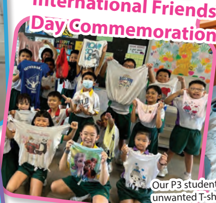
Our P3 students upcycled unwanted T-shirts into tote bags.