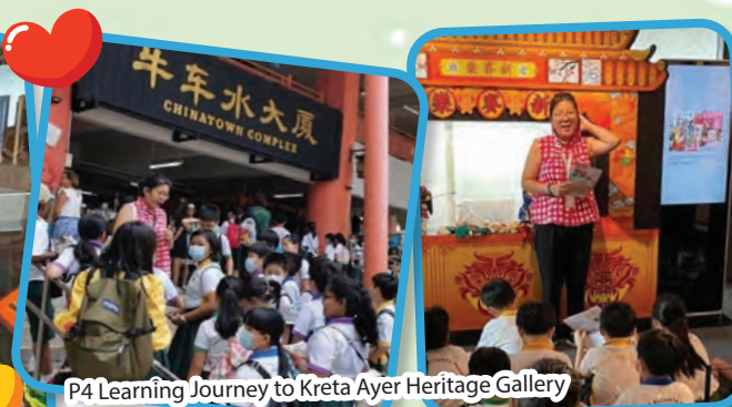
P4 Learning Journey to Kreta Ayer Heritage Gallery