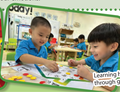
Learning how to count through games