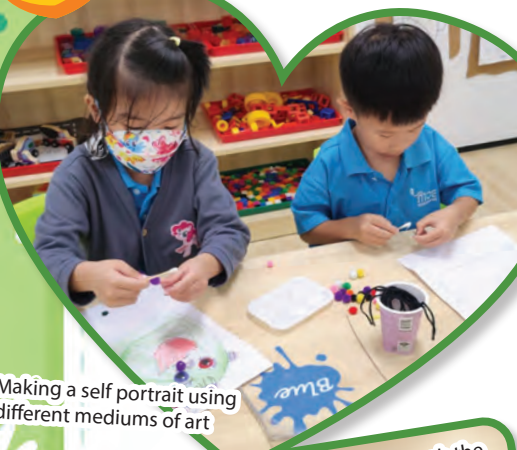
Making a self portrait using different mediums of art