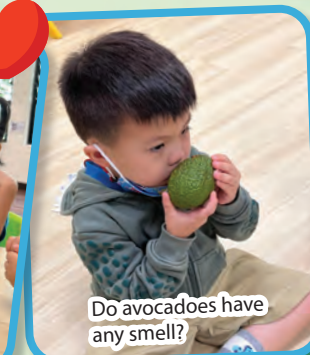
Do avocados have any smell?