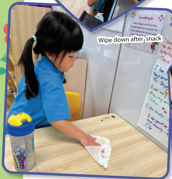
Wipe down after snack

All that learning always makes us hungry! We have a light snack between our curriculum hours to be energised and all our snacks provided are healthier choice options.