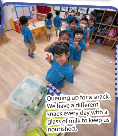
Queuing up for a snack. We have a different snack every day with a glass of milk to keep us nourished.