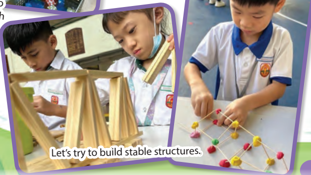
Let's try to build stable structures.