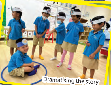
Dramatising the story