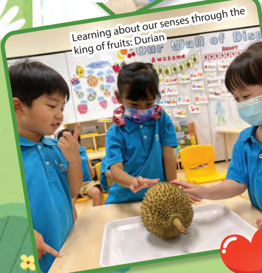
Learning about our senses through the king of fruits: Durian