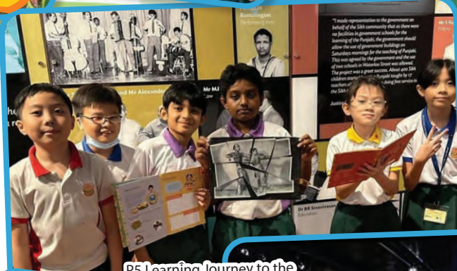
P5 Learning Journey to the Indian Heritage Centre