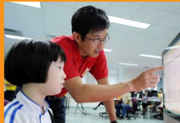
North East PC Family Programme

Moving forward, the CDCs would continue to focus on their strategic work areas of ABC. They would continue to rope in the more successful Singaporeans to help the needy. They will work with like-minded community and corporate partners as well as GROs, civic groups, religious organisations and government agencies to bring residents together so as to achieve the vision of making Singapore a Great Home and a Caring Community.