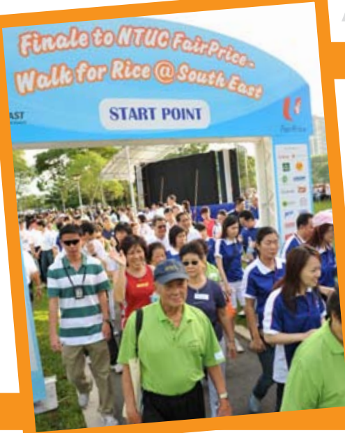
Partnership between SE CDC and NTUC Fairprice for "Walk for Rice"