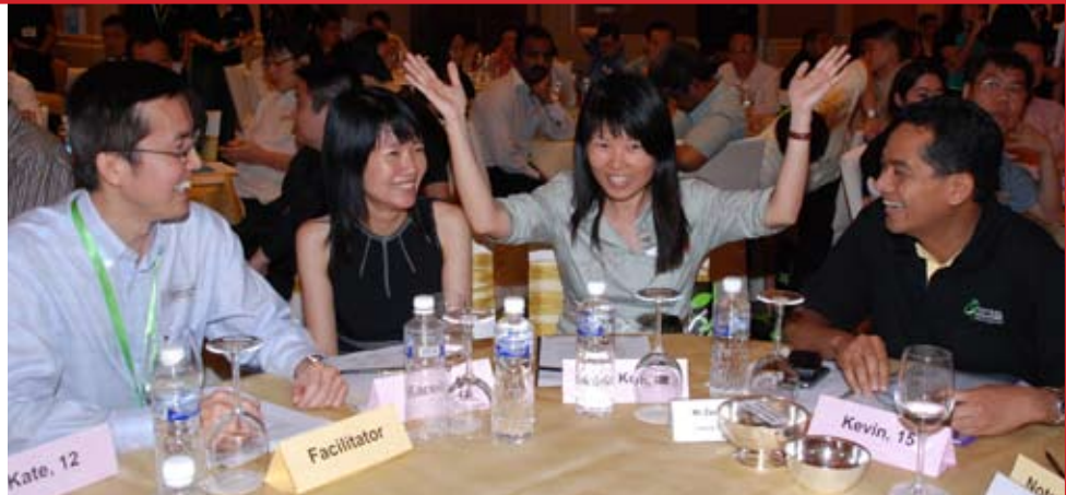
Engaging stakeholders at district meetings

engaged more than 1,200 senior citizens through IT. The website featured videos and articles of celebrities promoting active ageing, a calendar of senior citizen related activities across the island as well as simple online games and competitions for participation by the elderly.