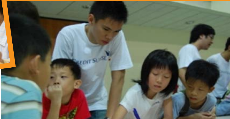
Rice that Binds programme partnership with Tong Seng Produce, OCBC Bank, Top Advertising, Big Foot Logistics and ST Delivery