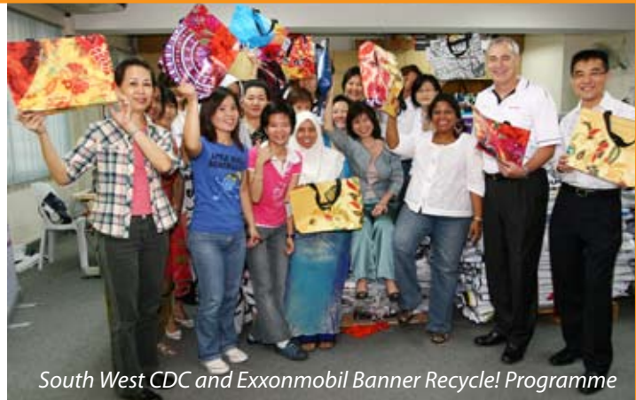
South West CDC and Exxonmobil Banner Recycle! Programme

Between July and September 2009, North West CDC rallied about 40,000 volunteers from schools, VWOs, companies and public to fold cranes under the Rice that Binds, Cranes @ North West. It raised 63,000 kg of rice for the needy. The partners for this programme included Tong Seng Produce Pte Ltd, OCBC Bank, Top Advertising Pte Ltd, Big Foot Logistics Pte Ltd and ST Delivery Services.