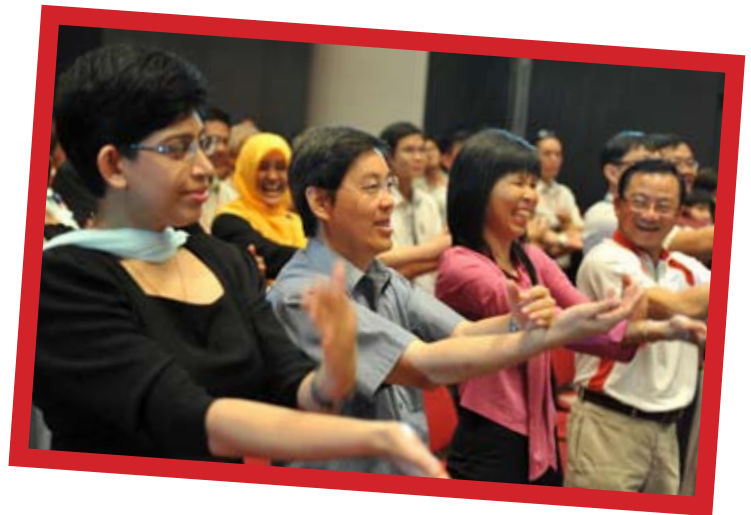
Clapping Hands Routine at South East CDC District Meeting

In response to the national drive to promote and foster social integration among Singaporeans, especially between Singaporeans and new immigrants, the first Game Show-style IntegrateSingapore Quiz @ South West – the brainchild of the CDC's District Councillors was organised. It is a new platform for Singaporeans and new immigrants to work together as a team, know one another, and in the process deepen their knowledge of Singapore.