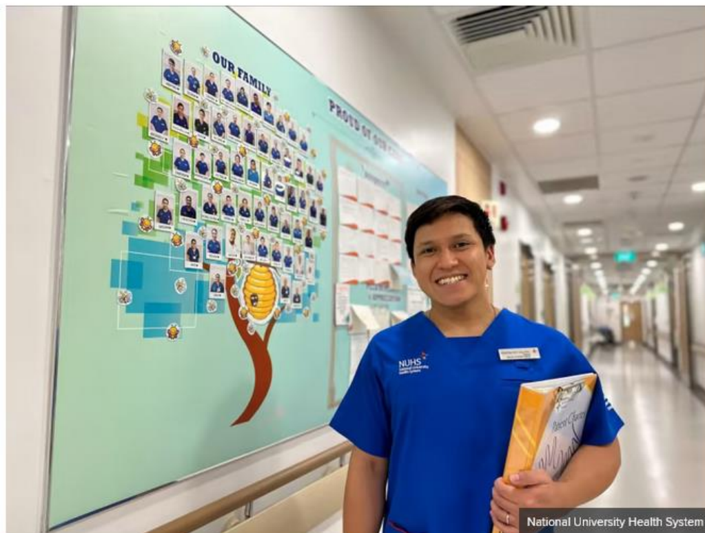
National University Health System

The author is a staff nurse in an orthopaedic surgery ward at the National University Hospital.