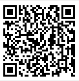
Get the latest information and advisories for MCSTs on COVID-19