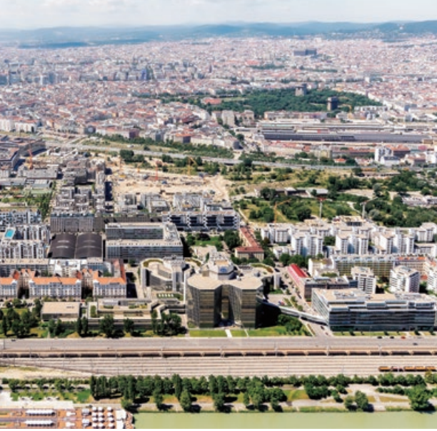
Aerial view of Nordbahnhof.