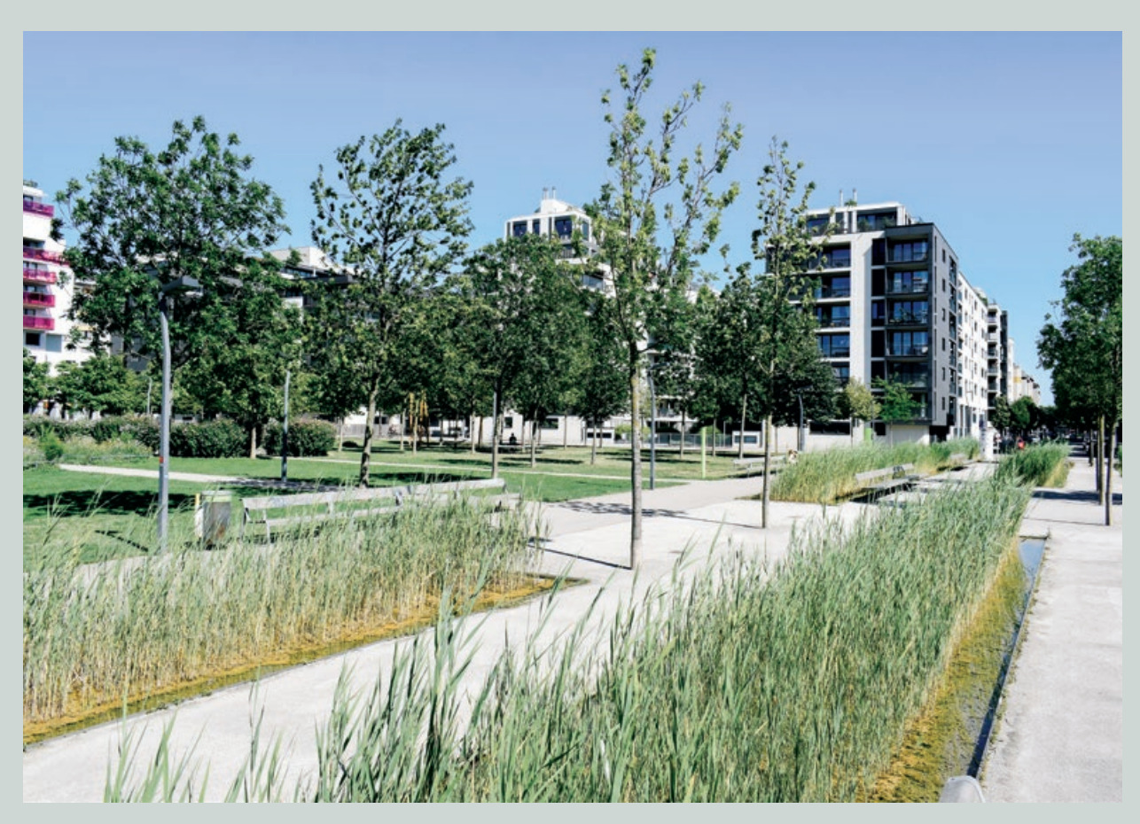
Rudolf-Bednar-Park, a park in a modern residential neighbourhood.

In June 2020, the city designated three areas as its first "climate protection areas", where new buildings are permitted only if equipped with climate-friendly heating and hot water supply systems. These areas will be extended to phase out fossil fuel-based heating and cooling systems in existing buildings.