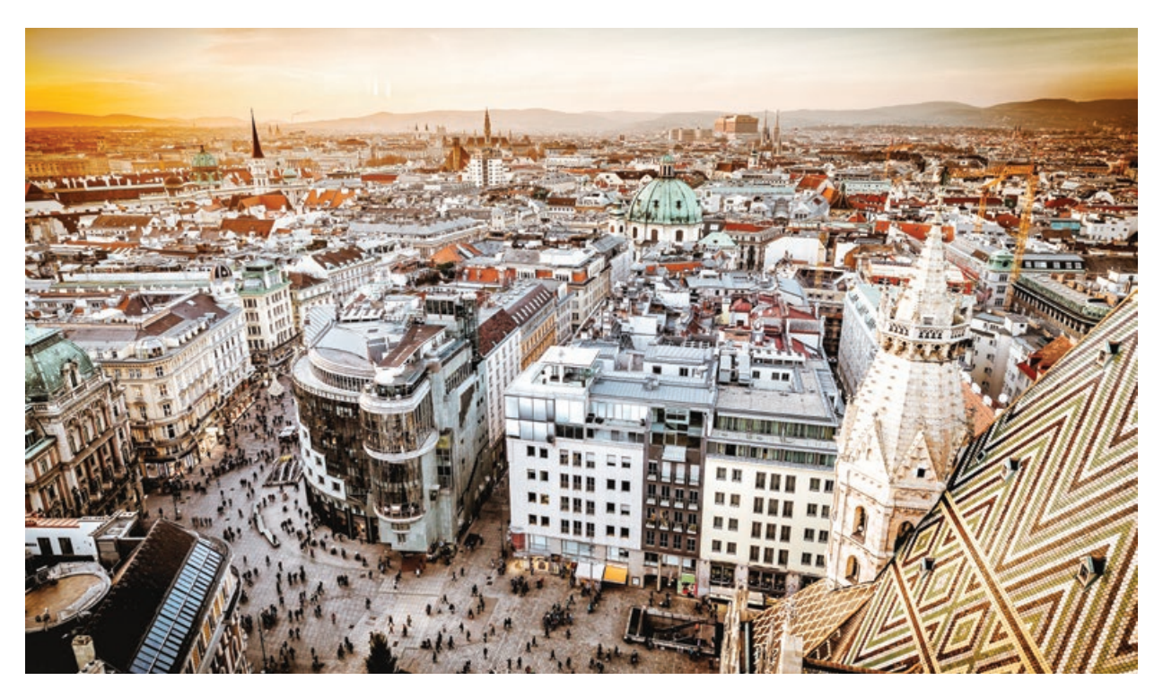
Vienna's historic centre.