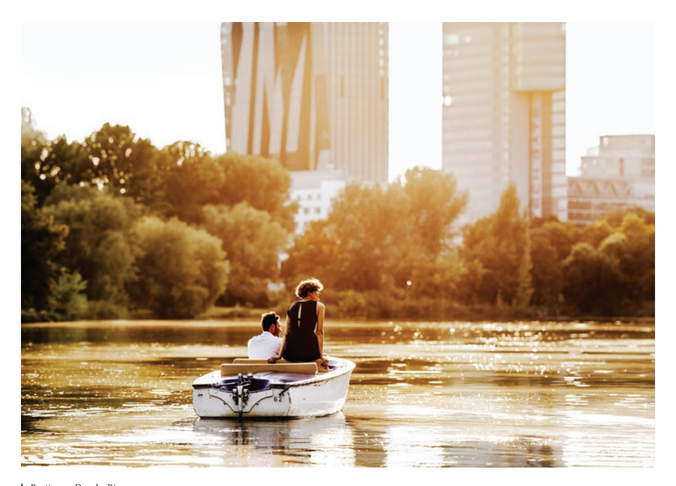
Boating on Danube River.

"We have one of the densest public transport networks, are among the best in Europe when it comes to eco-friendly district heating, and have over 50% of our land area dedicated to green spaces. We are in a very good position and will continue to intensify our efforts in climate protection in all areas of the city," said Vienna's Mayor Michael Ludwig.