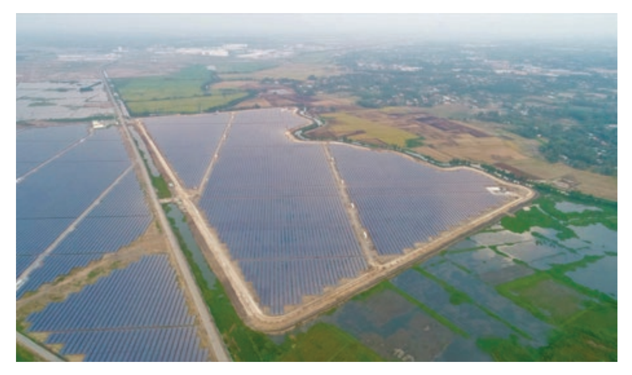
A solar array that Standard Chartered financed in Vietnam.

But finance for emerging markets has historically proved challenging. Truly transformative projects often cannot be funded by the public sector alone.