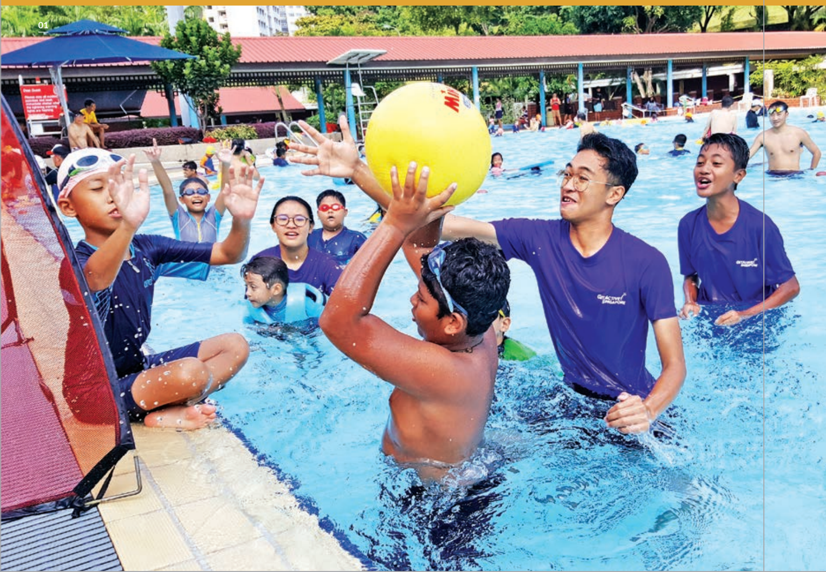
01 Children enjoying a game of modified water polo with Team Nila volunteers.

For example, at the Woodlands Sport Centre, Team Nila regularly engages residents from the neighbourhood to participate in sporting activities. This includes water activities and the Sporting Friday initiative, where activities are organised on Friday evenings by both Team Nila and ActiveSG Sport Centre staff. Volunteers can also join interest groups like sport safety or sport photography to try new activities, hone their passions and bond with like-minded peers.