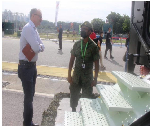
Members enjoying a tour of the many SAF assets and platforms that were on display during AOH22.