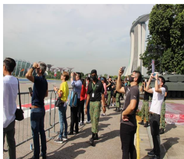
The Red Lions wowing members with their display of skills!