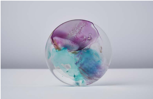
Wyn-Lyn TAN, 1300 , 2020.

Space, light, colour and rhythm are building blocks in Wyn-Lyn Tan’s language of painting. The works in A Matter of Time highlight Tan’s interests in the subtle shifts of one’s perception of space and time, and how that extends into a painting.