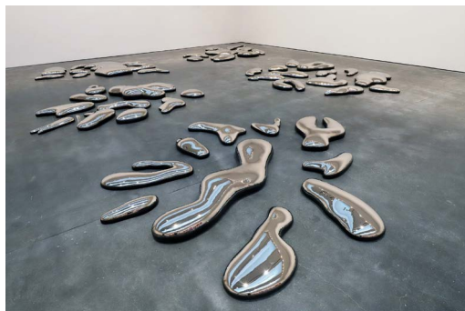
Yayoi Kusama, Clouds , 2019.

YAYOI KUSAMA: RECENT PAINTINGS , features 15 monochrome paintings from the series My Eternal Soul (2019 – 2020) alongside CLOUDS (2019), a sculpture installation consisting of pieces of mirror-finished stainless steel forms. This exhibition is exemplary of Kusama's continuous innovation, uncompromising vision and compelling charm that captivates people all around the world.