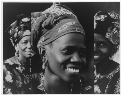
Trinh T. Minh-ha, Reassemblage (Film still), 1982.

Trinh T. Minh-ha. Films. is the first solo exhibition of filmmaker, music composer, anthropologist, feminist and postcolonial theorist Trinh T. Minh-ha in Asia. Five of her films from 1991 to 2015 are presented alongside her newest work, What about China? (Part I of II, 2020–21), initiated by NTU CCA Singapore, and co-commissioned with Rockbund Art Museum, Shanghai.