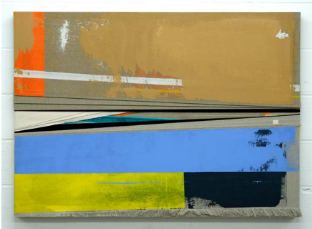
Ash Ghazali, Malay Boy , 2019.

Ash Ghazali’s series of ‘Cut Paintings’ combines geometric abstraction with traditional fabrics from ethnic Malay garbs. The dimensional paintings are an exploration of Ghazali’s personal search for an ‘authentic’ culture and identity, and also function as sculpture – the folds and shadows creating the illusion of depth and tension.