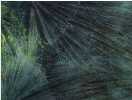
Cole Sternberg, they seemed willing to suffer death rather than risk getting wet , 2019.

Threads and Tensions: The Interconnected World is a collective of stories and histories told through the medium of fabric, painting and other textures by artists around the globe during one of the most unpredictable times in the modern era.